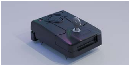
Klima-Flex Latch Hinge