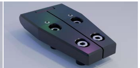
Klima-Flex 3D Hinges