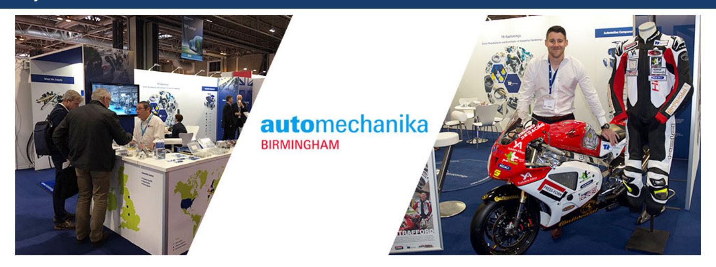
NEC, 5-7 June, Stand D17

TR Fastenings (TR) will be exhibiting at Automechanika Birmingham from 5th-7th June 2018, when the successful exhibition for the automotive supply chain returns to the NEC for its third year.