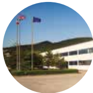
TR VIC (Italy)