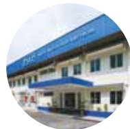
TR PSEP (Malaysia) x 2