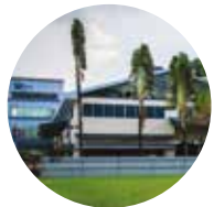
TR Formac (Singapore)