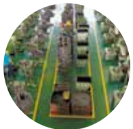
TR SFE (Taiwan) x 2

Annual output approximately 8 billion parts