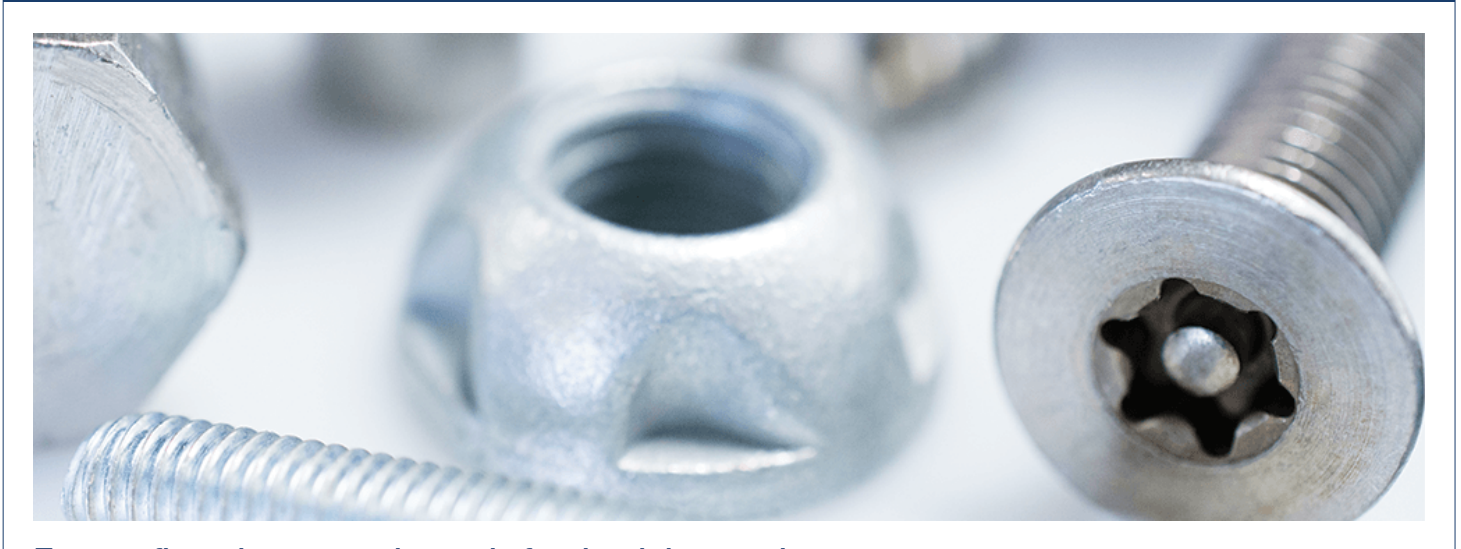
Easy to fit and remove - but only for the right people

Leading fastener manufacturer and distributor TR Fastenings is offering a complete range of steel and stainless steel security fasteners designed with special heads that make removal impossible for anyone who does not have the right matching tools.