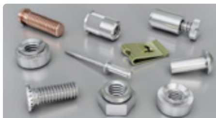
Fasteners for Sheet Metal

We can also support with a full range of fasteners and components including: