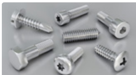
Screws & Bolts