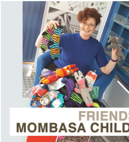
FRIENDS OF MOMBASA CHILDREN