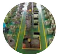
TR SFE (Taiwan) x 2

Annual output approximately 8 billion parts