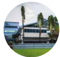
TR Formac (Singapore)